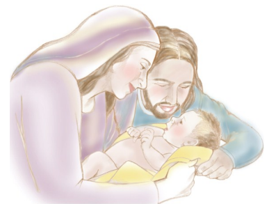
The Miracle of Christmas

First Presbyterian Church of Dutch Neck 154 South Mill Road Princeton Junction, NJ 08550